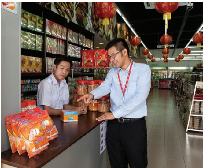
Our sales force help to grow businesses by increasing sales, enhancing efficiency and launching new opportunities.