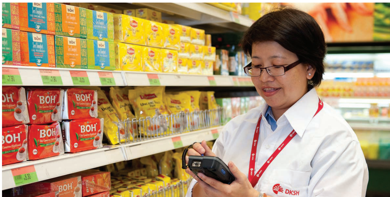
EchoPlus, our hand-held sales force effectiveness tool, allows our field-based sales force to instantly execute sales orders and view inventory.

DKSH Holdings (Malaysia) Berhad is majority-owned by the DKSH Group of Switzerland. Lembaga Tabung Angkatan Tentera (LTAT) has been the Company's Bumiputera partner since 1992 and remains a substantial and valued shareholder of the Company with just under 15% of the shares.