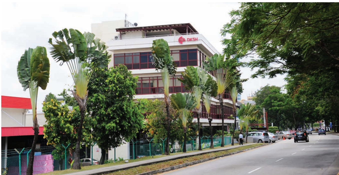
Our main office in Petaling Jaya.

* The Group's Revaluation Policy is disclosed in Note 2.4 on pages 52 and 53 of the Annual Report.