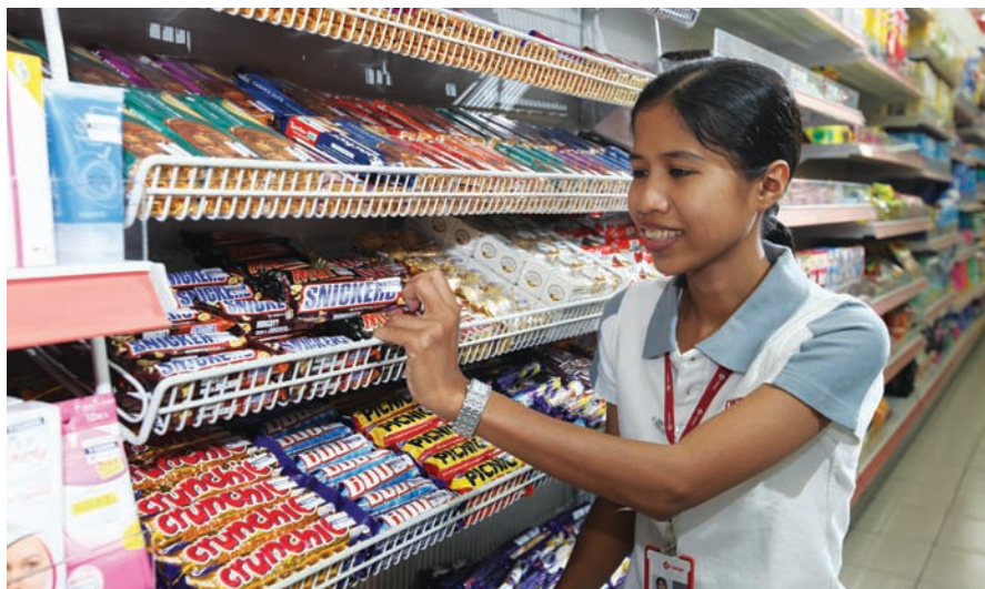
We touch the daily lives of people across Malaysia by providing a vast portfolio of products for daily use, including many of the world's best-known brands.

This segment also includes properties utilized by the operating unit as well as costs which are not allocated to operating units such as IT costs for services that benefit all businesses of the Group.