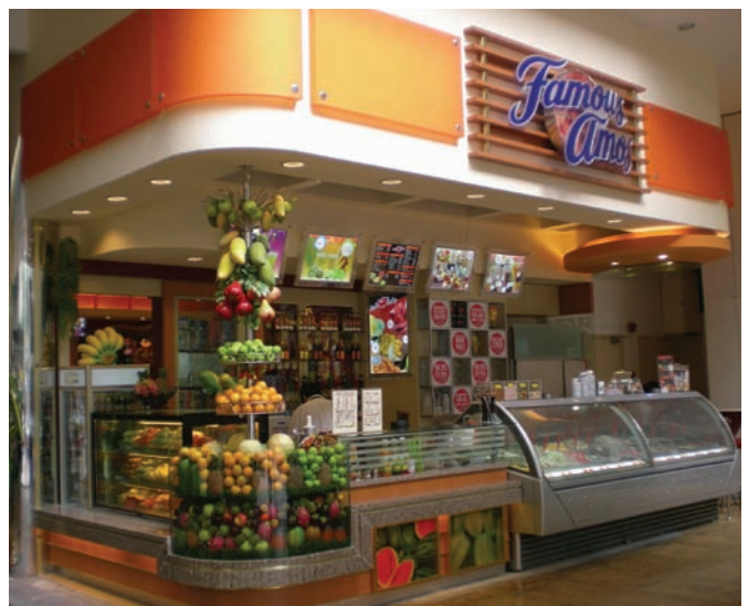
Our Famous Amos Chocolate Chip Cookie business: 59 outlets nationwide and growing.