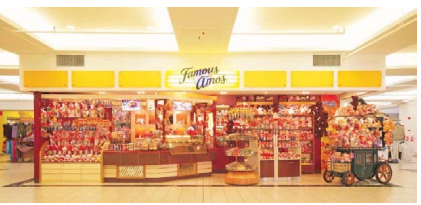
Tesco Cheras Outlet

Since May 1, 2006, the Group's ERP system