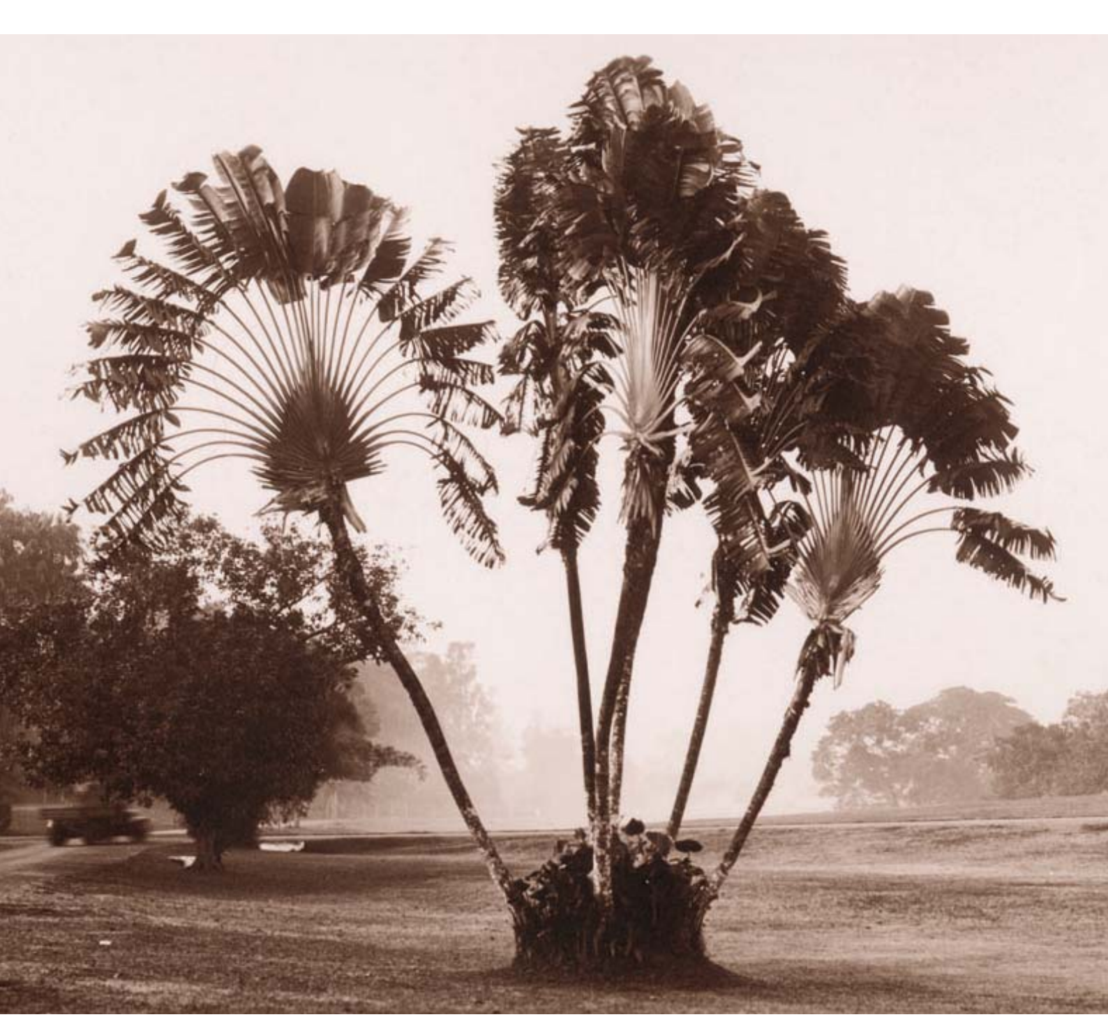
From the book, The Fantree Company , and the company archive of Diethelm Keller Holding Ltd.