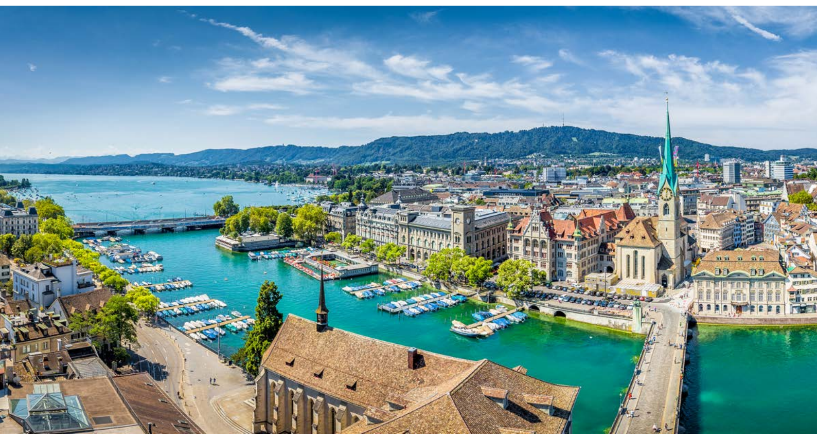
DKSH Switzerland Ltd. Headquarters, Zurich