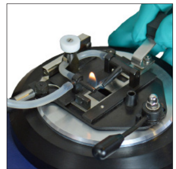
Dip the test flame, flash detection is automatic