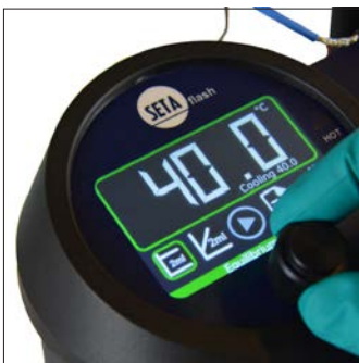
Select test temperature