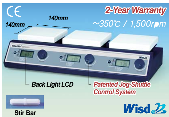
3×1 Plates-type Multi-Hotplate Stirrer "SMHS-3"