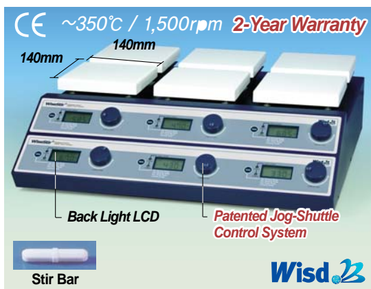
3×2 Plates-type Multi-Hotplate Stirrer "SMHS-6"

* 3 Rear Hotplate Stirrer SMHS-6 have 3 Ports available to connect External Temp. Probe