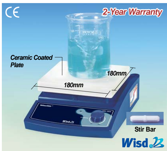
Premium Magnetic Stirrer with Stir Bar “MS-20A”