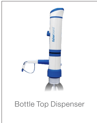
Bottle Top Dispenser