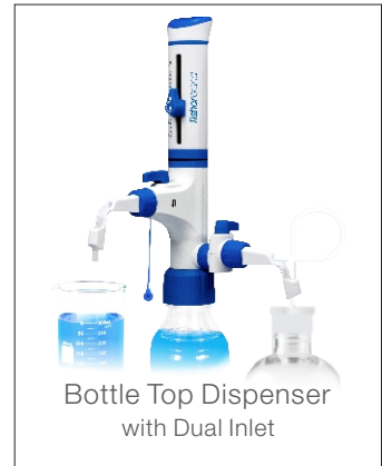
Bottle Top Dispenser with Dual Inlet

Fisherbrand™ offers three lines of bottle top dispensers which caters to every laboratory need from simple dispensing to handling of aggressive and hazardous chemicals and reagents. Fisherbrand dispensers are robust in design with a PTFE piston for smooth movement, easy volume setting, high chemical compatibility and an adjustable delivery nozzle for ease of working in challenging laboratory conditions. These dispensers are fully autoclavable and have easy user re-calibration.