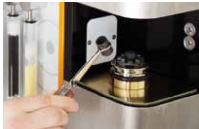
Placing the crucible