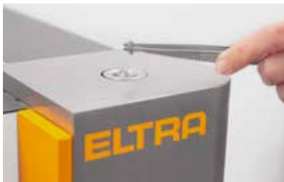
Introducing the sample

All ELTRA analyzers are characterized by their simple operation and quick C/S or O/N/H measurement of powders, granules, wires or foils. After weighing the sample and logging it into the software, all further steps are carried out automatically and the results are provided shortly after the analysis has started.