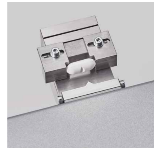
Clip-on jaws for 3-point bending strength test