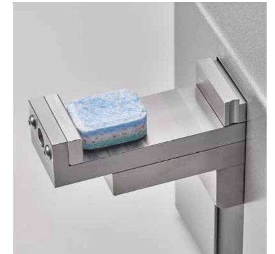
Extended jaw for testing large objects up to 65 mm