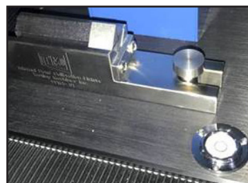
Optional set of verification blocks to check machine operation