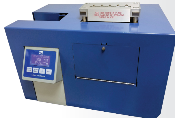
80-30 Ibond Prep Station

The Internal Bond™ Tester is designed to determine the internal bond strength of a variety of Paper and Board materials according to TAPPI T 569 and ISO 16260. The instrument design is based on a falling pendulum which creates a high speed impact on a paper specimen. The paper specimen is sandwiched between two double-coated tape substrates. The pendulum impact measures the total energy required to delaminate the internal fibers of a specimen in a “Z” type direction into two plies.