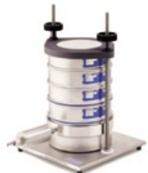
UIS250L at lab sieve tower