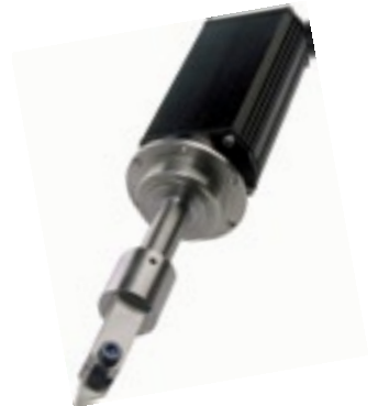
cutting and welding