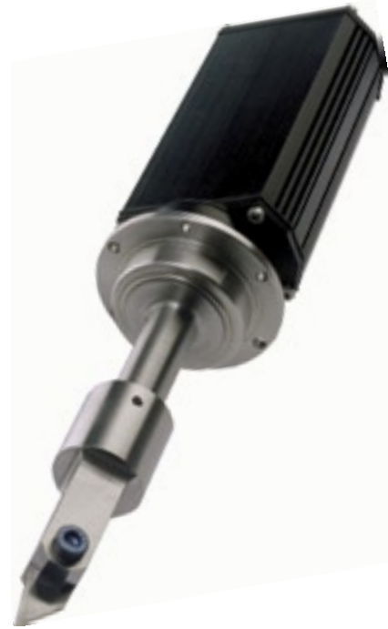
UIC400 with short blade

Exchangeable blades, which are selected to the cutting criteria of the respective application case such as the material, shape and length, are used as tools. The ultrasonic processors can also be constructed for the use in the food industry.