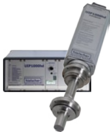
UIP1000 and sonotrode with flange

For use in the food or pharmaceutical industry, these ultrasonic processors are available with stainless steel housings.