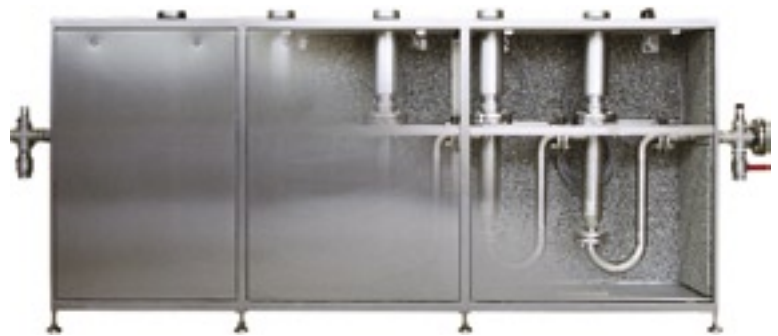
10kW ultrasonic flow system/sound protection (5 x UIP2000)