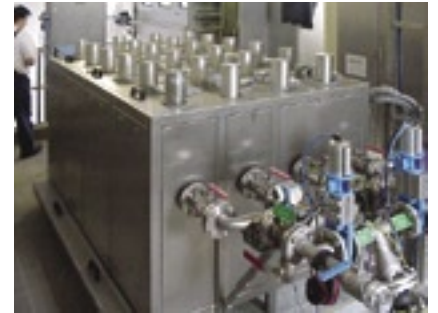
48kW flow system (24 x UIP2000)