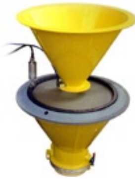
industrial ultrasonic sieving