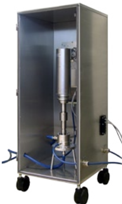
UIP2000 with flow cell/sound protection

operating needs the generator is located in a housing or in a cabinet and is equipped with control displays as well as with electrical interfaces. Important applications for the UIP2000 are the intensive cleaning of continuous material such as wires, tapes and profiles, of single components or bigger bores. Sonotrodes are chosen to match to the application. The treatment of sewage sludge for a better gas yield, the production of very fine emulsions and suspensions, the extracting and homogenizing as well as the reducing of germs are applications with this device in large scale. Corresponding sonotrodes e.g. the cascade sonotrode provide the required intensity of ultrasonic treatment of the liquid. Corresponding flow cells are offered for continuous operation. Sound protection casings complete the ultrasonic system based on UIP2000.