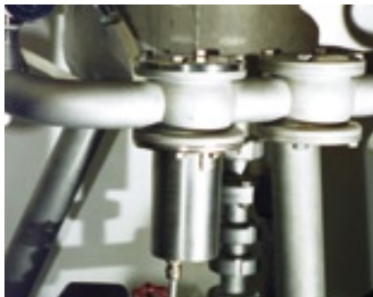
UIP50 for the cleaning of sensors

The ultrasonic processor UIP50 with a power of 50 watts and a frequency of 30kHz as well as the UIP250 with 250 watts and 24kHz are alternatives to the laboratory devices with similar power. They are used for hostile operation conditions. The robust aluminium housing of the transducer with its degree of protection (IP54) withstands dust, dirt, higher temperatures and humidity. The generator, supplied in a housing or as plug-in module for a cabinet, can be located outside the hazard zone.