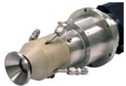
UIP1000 with sonotrode for nebulizing