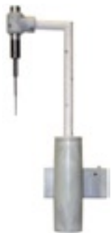
UIP50 as OEM-component