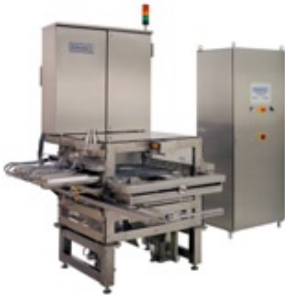
ultrasonic cutting system (8 blades)

The ultrasonic processors UIC400, UIC500 and UIC1000 with a power of 400, 500 or 1000 watts, respectively, and a frequency of 20kHz are developed especially for cutting tasks. This cutting method is nowadays a proven technique, in particular for cutting plastic sheets, textiles, cardboards, rubber, plastics and food. In general ultrasonic cutting means the excitation of a cutting tool or of the counter-bearing. The main advantage is the significant better cutting quality. Lower feed force permit higher cutting speed. Sludge cakings at the blades are removed by the ultrasonic oscillations. The lower wear of the tools and the resulting longer durability have a cost-saving effect.