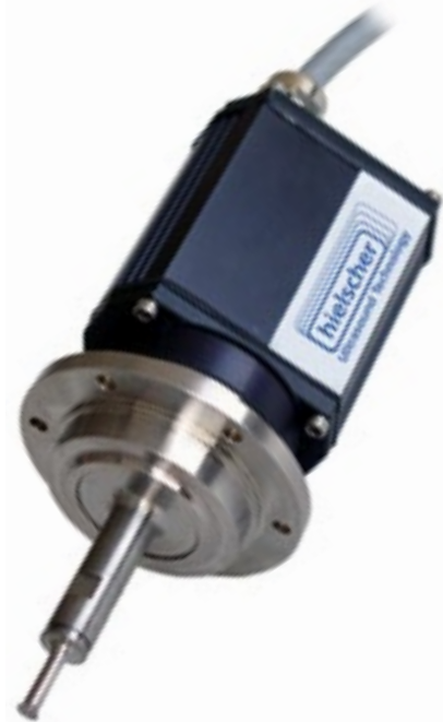
UIP25 with sonotrode for nebulizing