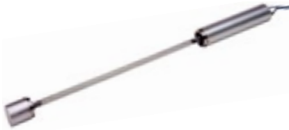
UIC1000LB with long blade (800mm)