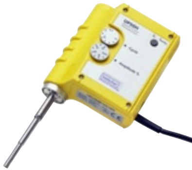
ultrasonic laboratory processors