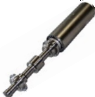
UIP2000 and sonotrode with flange