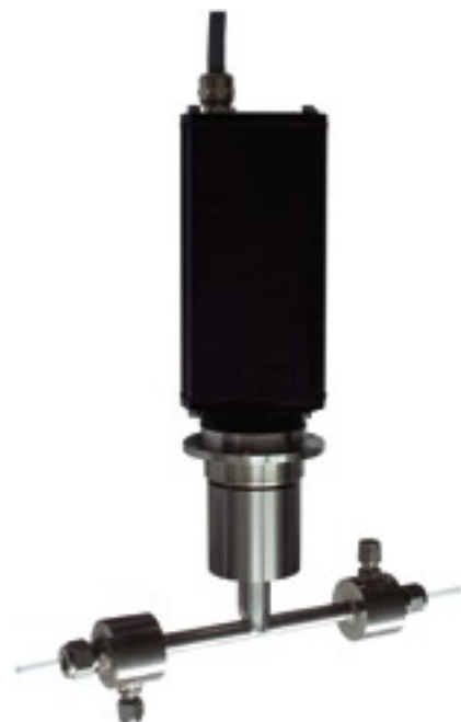
UIP250 with mini flow cell

The oscillating-free flange of the transducer permits positioning accurately in machines or robot arms. For the sonication of liquids at higher temperatures of up to 300°C and pressures of up to 300 atm we offer longer sonotrodes with pressure-tight flange connections.