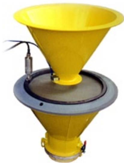
UIS500 at sieve frame

Please ask for our detailed sieving information for laboratories or industries.