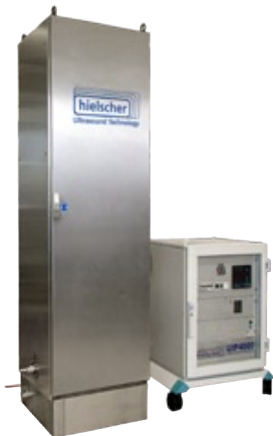
UIP4000 with flow cell/sound protection

The UIP4000 (4,000 watts, 20kHz) is used mainly for the industrial processing of liquids such as homogenizing, dispersing, disintegrating or deagglomerating.