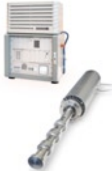
ultrasonic industry processors