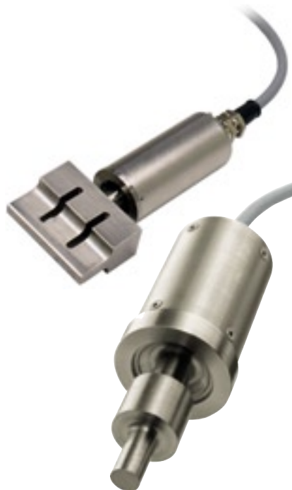
UIW300 and UIW800

With such ultrasonic energy, the thermoplastic material will be preheated and becomes soft or liquid. This effect is used for forming and connecting the individual materials. It is also satisfactory, if only one component is thermoplastic or if a thermoplastic adhesive is applied between the components. The advantage of the ultrasonic welding compared to thermal welding is a shorter time cycle, a higher quality, lower energy consumption as well as the avoidance of heat and damaging steam effects. The ultrasonic processors weld straight pieces or surfaces. The sonotrodes i.e. the welding heads can be customized according to the geometry of the lines or surfaces. The