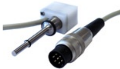
UIP12 (90kHz) as OEM-component

textile ribbons directly at the loom. If the ultrasonic processor is manufactured as handheld device both an ergonomic friendly design and the safety standards e.g. in the medicine or food industry have to be considered.