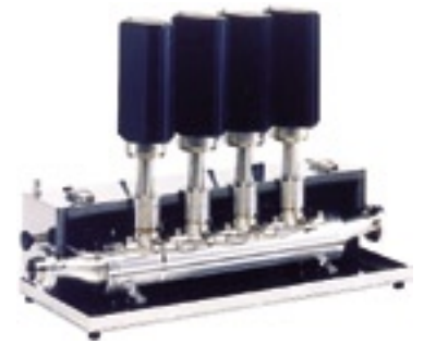
flow cell for food (4 x UIP500)