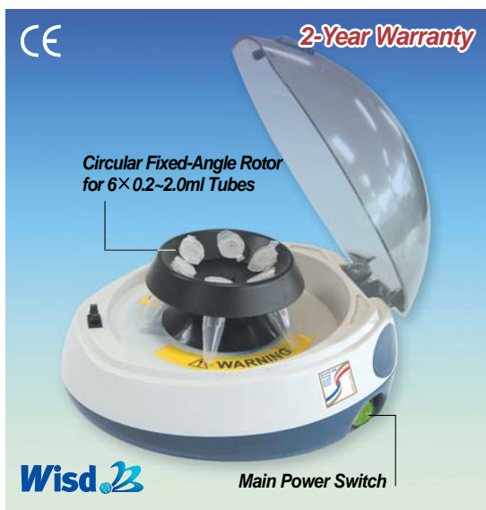
Mini-microcentrifuge Set "CF-5" with Circular Fixed Angle Rotor