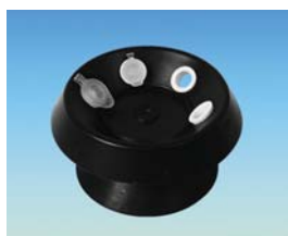
(1) Circular Fixed Angle Rotor For 6 × 0.2-/0.5-/1.5-/2.0-ml Tubes