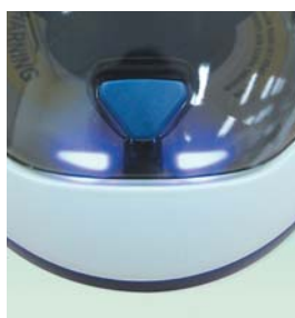
Operation Display LED Lamp