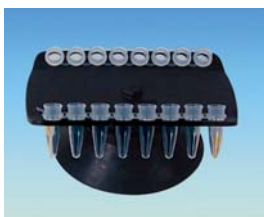
(2) Fixed Strip Rotor For 2 × 0.2ml PCR 8-tube Strips or 16 × 0.2ml PCR Tubes